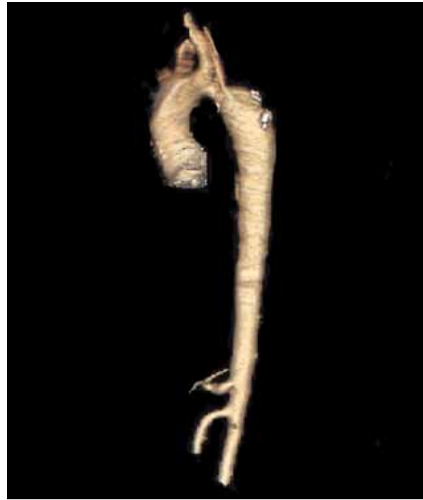
Figure 1B- Preoperative CT angiography showing re-CoA segment and diffuse stenosis of the AAH.

Elective surgical treatment of the re-CoA was planned and extreme care was taken for the dissection of the distal aortic arch and the proximal descending aorta because of the possible increased friability of the arterial wall and adhesions through a redo left thoracotomy. The left common carotid artery and the subclavian artery were gently clamped and the proximal descending artery and aortic arch were cross-clamped between the brachiocephalic artery and the left common carotid artery. A longitudinal incision was performed in the concavity of the aortic arch (across the re-CoA segment). He underwent aortic enlargement with a perpendicular Dacron patch in order to increase vertical distensibility.