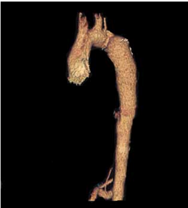
Figure 2B- Postoperative CT angiography showing an excellent result after insertion of a Dacron patch plasty.

tubular AAH this approach may not be recommended (4).